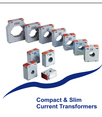
Compact & Slim Current Transformers

STEIG offers compact, low loss & wide range of window type Current Transformers (CT) 1A & 5A (secondary), Class 1 & 0.5 for panel board.