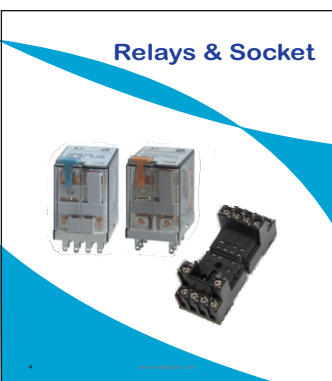
Relays & Socket

STEIG General Purpose Relays are compact, and long life with wide range of voltage 12V, 24V, 48V, 110V, 230V AC/DC.